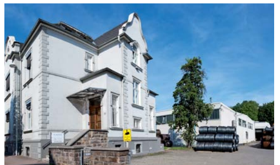
The KÜNNE Group administration in a traditional building and the highly modern production in Hemer.

We produce high-quality wires in dimensions and surfaces conform to the market. Our comprehensive storage capacities always guarantee the demanded volumes and qualities within the required delivery times for our international customers. The ambition to be a part of a functioning value added chain as well as striving for the highest customer satisfaction are some of our principles.